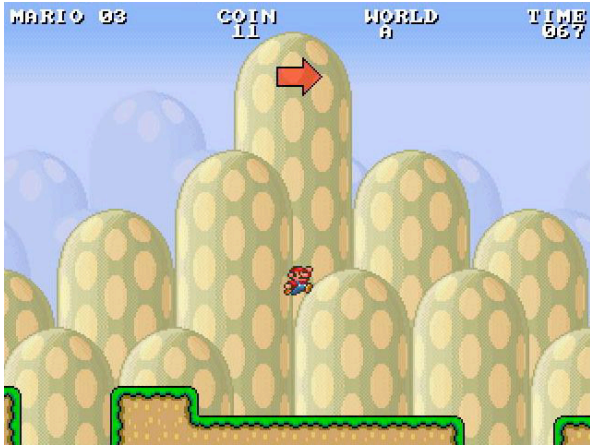
Fig. 1. Infinite Mario Bros.

cluding our own simulated car racing competitions [12]. The benchmark developed for this paper is therefore also used for a competition run in conjunction with international conferences on CI and games, and complete source code is downloadable from the competition web page 1 .