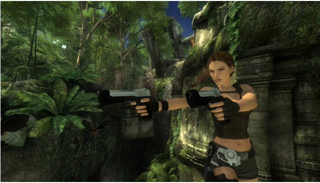
Fig. 1. A screenshot from Tomb Raider: Underworld level “Thailand”.