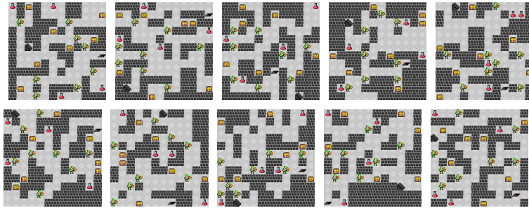
Fig. 1: The levels used for collecting player data and for evolving procedural personas.